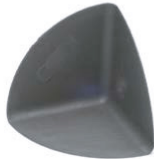
TPE Internal Corner L95