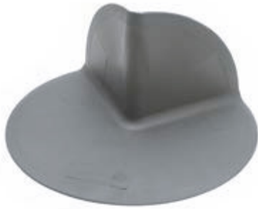
TPE External Corner L95