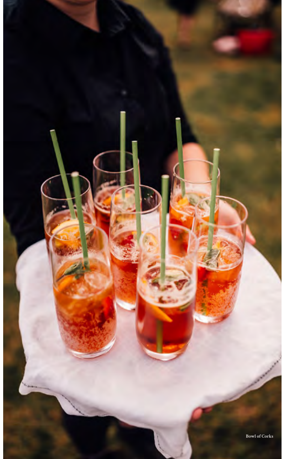
Bowl of Corks