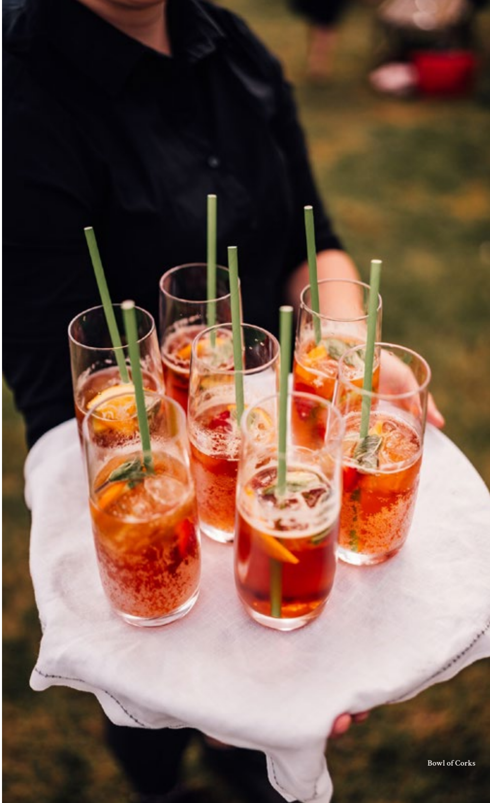
Bowl of Corks