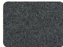
Frost Grey 2067