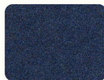
Lagoon Blue 5516