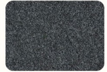
Frost Grey 2067