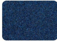
Lagoon Blue 5516