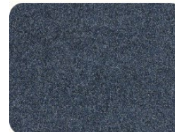
Ensign Blue 5524