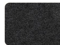
Frost Grey 2067