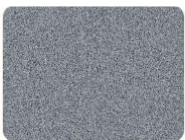
Shimmering Sea 4111