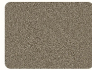
Dawlish Driftwood 4109