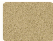
Classic Clay 4104