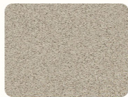
Cotton Cloud 4112