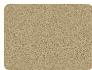
Sand Salt 4103