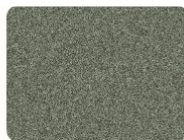
Soft Seaweed 4115