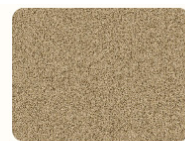
Mild Malt 4105