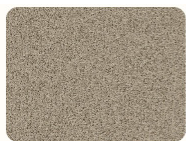
Tranquil Truffle 4101