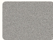
Cool Chrome 4113