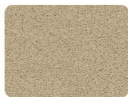
Light Lace 4102