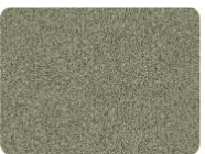
Wilting Willow 4110