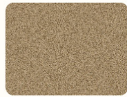
Hessian Hue 4106