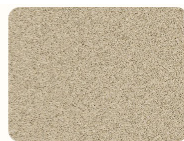
Pure Pebble 4107