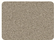
Fleeting Fawn 4108