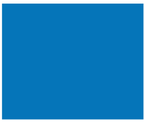
★ Berkshire Blue