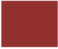
▲★ Colonial Red