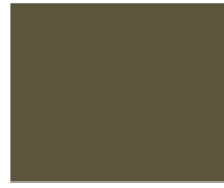
▲★ Medium Bronze