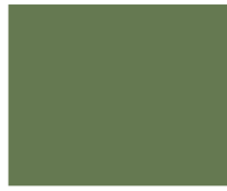
●▲★ Aged Copper