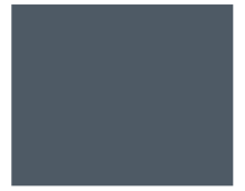
●▲★ Weathered Zinc