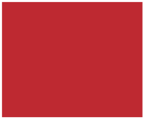
▲★ Cardinal Red