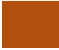
▲★ Terra Cotta