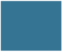
▲★ Military Blue