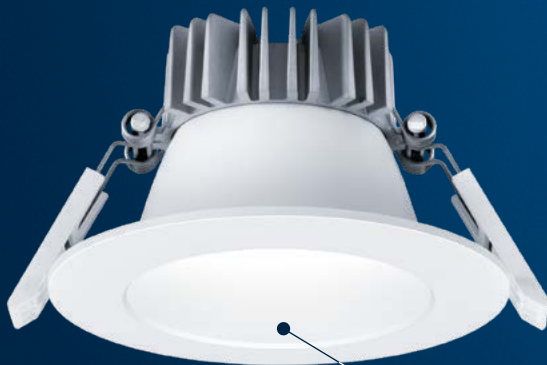
MEDIUM (M) CUT OUT: 145 – 180 MM